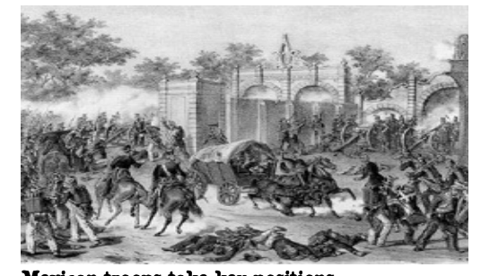
Mexican troops take key positions

All correspondence to be directed to the editor at 3 South Main Street. Subscription information to the same